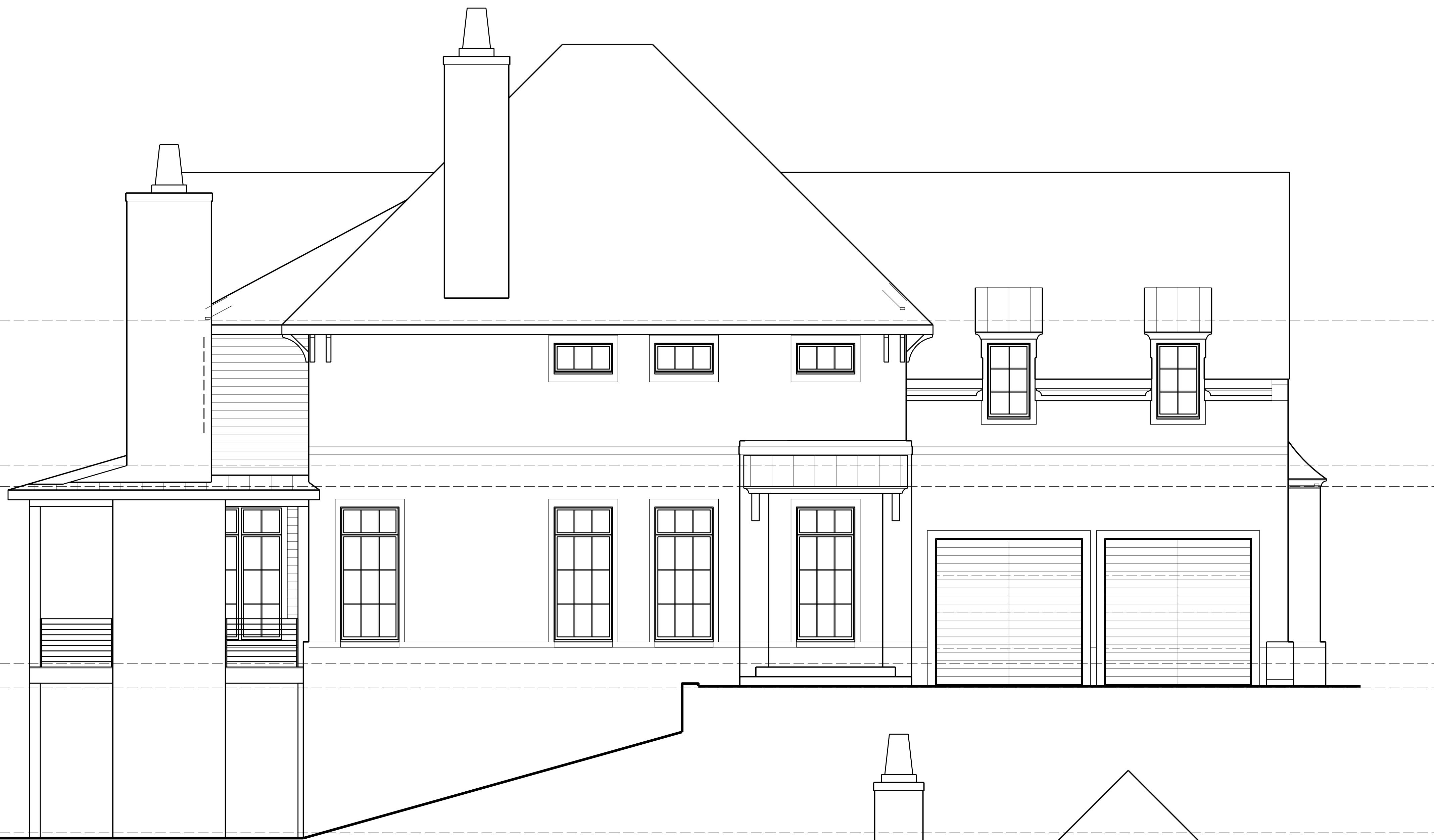
2 LEFT SIDE ELEVATION A6-1 SCALE: 1/4"=1'-0"

THESE DRAWINGS ARE INTENDED FOR THE USE IN THE SPECIFIC PROJECT AND SITE SHOWN. THESE DRAWINGS ARE NOT TO BE USED FOR ANY OTHER USES. OR ADDRESS. DO NOT REPRODUCE WITHOUT NOTIFICATION OR PERMISSION FROM CHADAM MATTISON, ARCHITECT, INC.