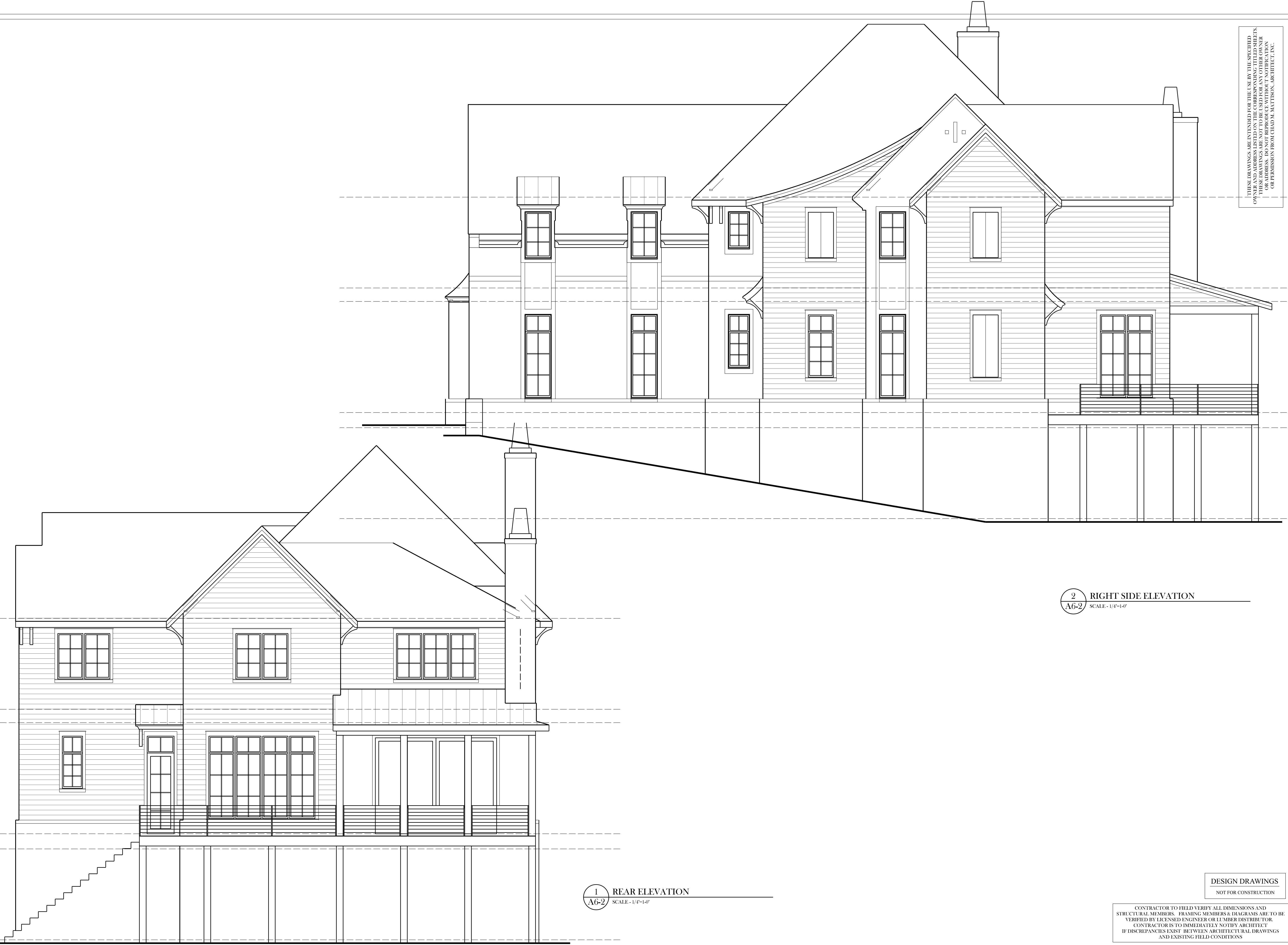
2 RIGHT SIDE ELEVATION SCALE: 1/4"=1'-0"

THESE DRAWINGS ARE INTENDED FOR THE USE BY THE SPECIFIED OWNER AND ADDRESS LISTED ON THE CORRESPONDING TITLED SHEETS. THESE DRAWINGS ARE NOT TO BE USED FOR ANY OTHER OWNER OR PROJECT WITHOUT THE WRITTEN PERMISSION FROM CLAUDIA MATTISON, ARCHITECT, INC.