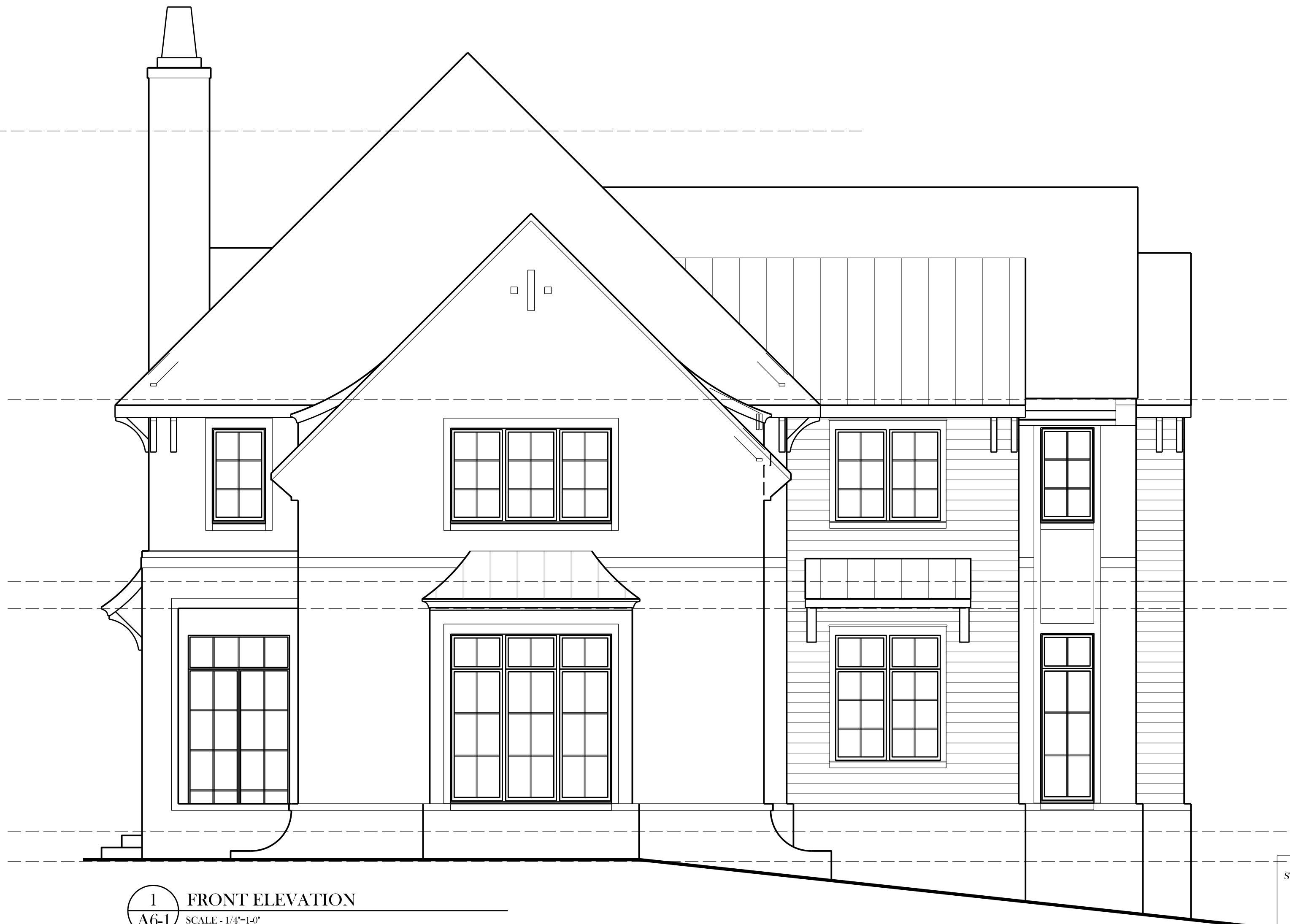
1 FRONT ELEVATION A6-1 SCALE: 1/4"=1'-0"