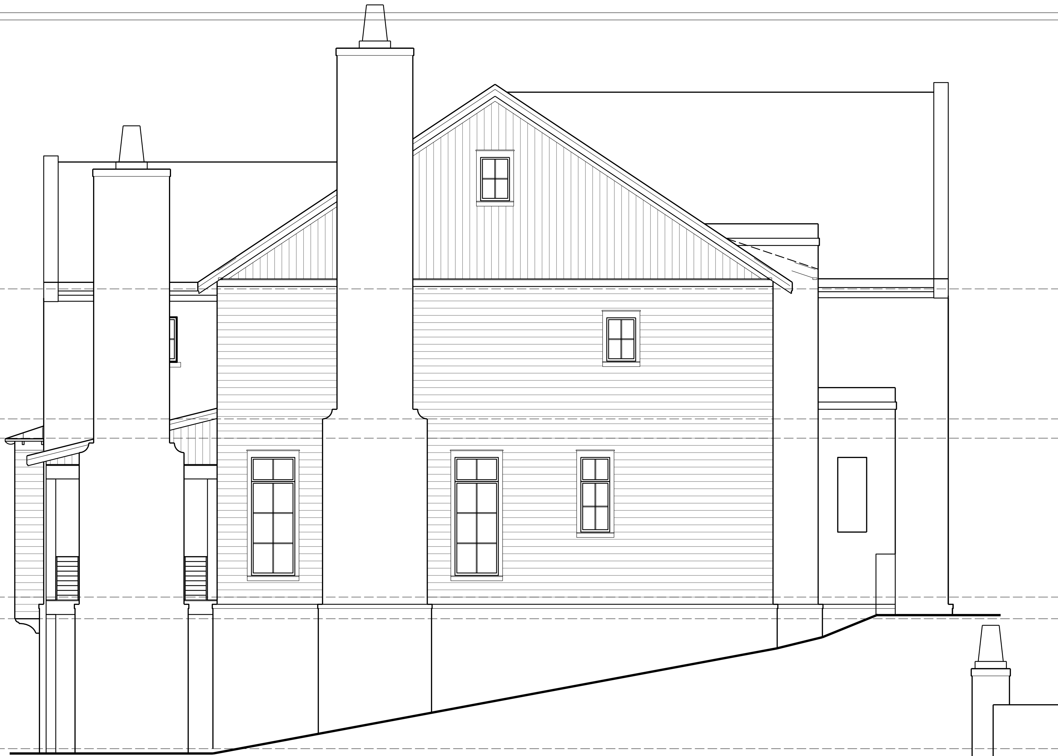
2 LEFT SIDE ELEVATION A6-1 SCALE - 1/4"=1'-0"

THESE DRAWINGS ARE INTENDED FOR THE USE BY THE SPECIFIED OWNER AND ADDRESSERS LISTED ON THE CORRESPONDING TITLED SHEETS. THESE DRAWINGS ARE NOT TO BE USED FOR ANY OTHER OWNER OR ADDRESS. DO NOT REPRODUCE WITHOUT NOTIFICATION OR PERMISSION FROM CHAD MATTISON, ARCHITECT, INC.