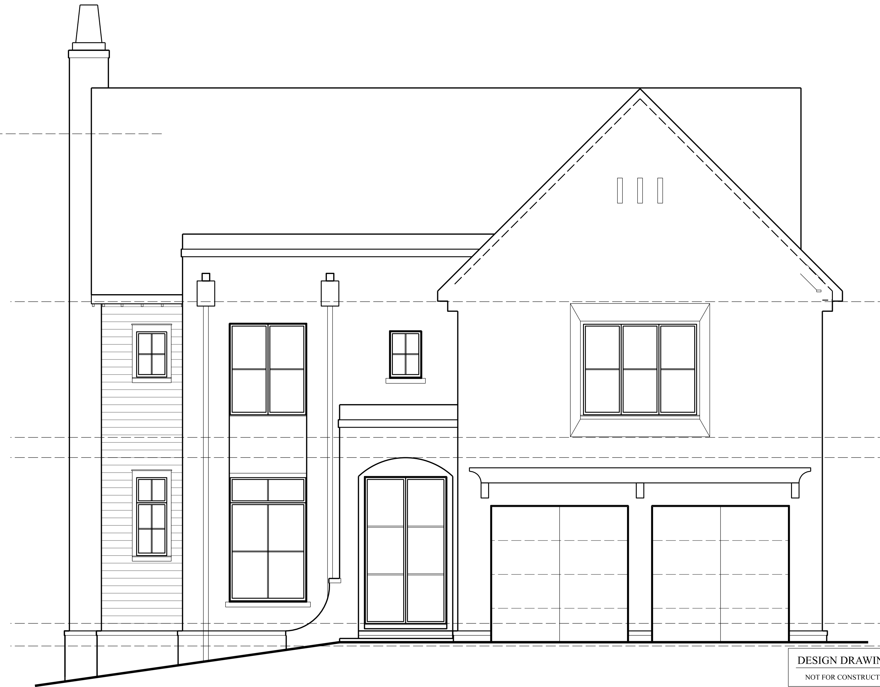
1 FRONT ELEVATION A6-1 SCALE - 1/4"=1'-0"