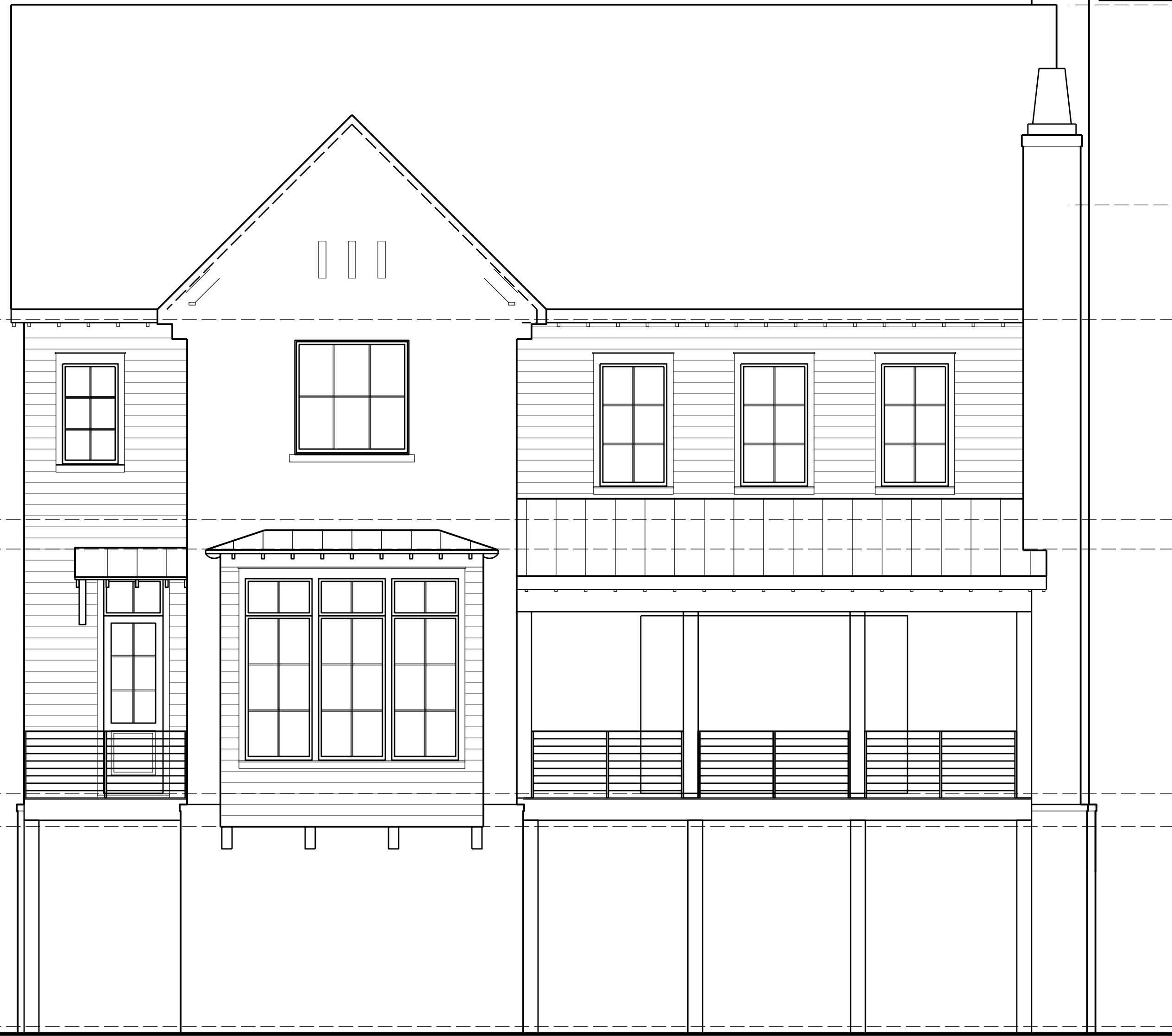
1 A6-2 REAR ELEVATION SCALE - 1/4"=1'-0"

THESE DRAWINGS ARE INTENDED FOR THE USE BY THE SPECIFIED OWNER AND ADDRESS LISTED ON THE CORRESPONDING TITLED SHEETS. THESE DRAWINGS ARE NOT TO BE USED FOR ANY OTHER OWNER OR ADDRESS. DO NOT REPRODUCE WITHOUT NOTIFICATION OR PERMISSION FROM CHADAL MATTERSON, ARCHITECT, INC.